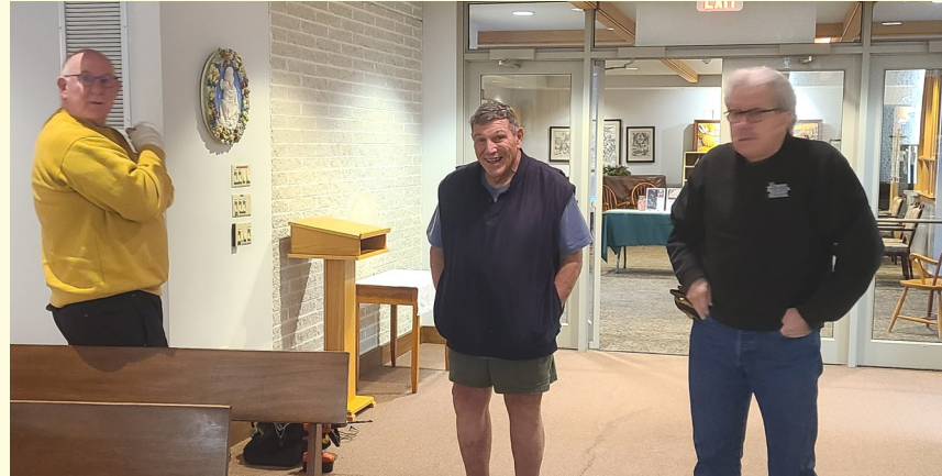
The executive committee watches from a safe distance.

And finally, ONE FOR THE LADIES! These pictures are “proof of concept” pictures. They may be used as inspiration or blackmail...you decide.