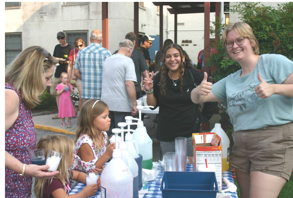
Snow cones were provided by Loft personnel. The kids needed that little sugar boost to get them through the evening before the ice cream social. They all succeeded with flying colors.